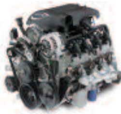
GM Vortec 6000